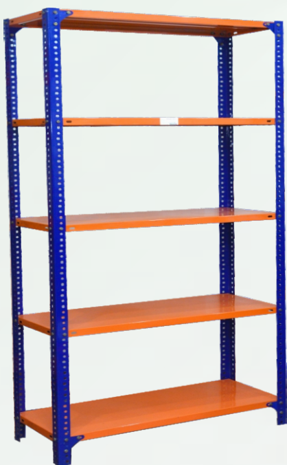
Slotted Angle Racks