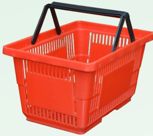
Shopping Basket (Plastic Hand Carry)