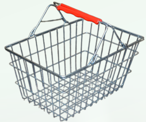
Shopping Baby Basket (Steel Wire)