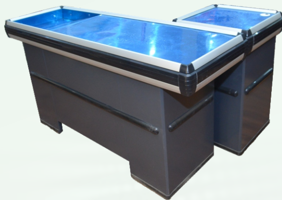
Cash Counter For Super Markets