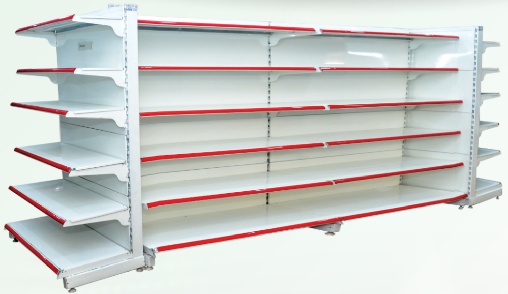
Gondola Racks & End Rack