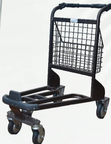
Passenger Baggage Trolley