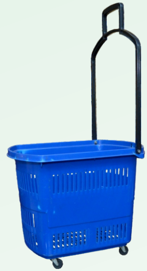
Plastic Roller Basket ( Imported)