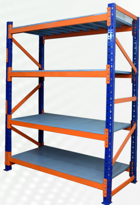
Heavy Duty Racks