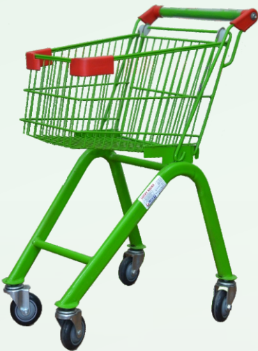
Shopping Baby Trolley